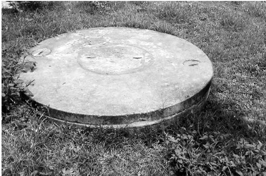
Figure 3: The lid of a concrete septic tank.

In the past, it has been common practice to use one septic tank and absorption trench system to treat all the wastewater from a house. This is called an “all waste” system. These days, it is considered better to have separate systems for greywater and blackwater. In the Northern Territory, it is a legal requirement that all septic tank systems in Aboriginal communities must have separate tanks and trenches for greywater and blackwater.