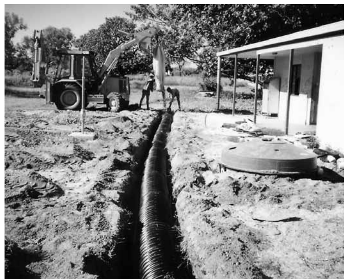
Figure 2: A new absorption trench being installed.

An absorption trench (also called a leach drain) is made of a pipe with holes in it, surrounded by gravel, and buried in the ground. These days, plastic pipes and arch-shaped plastic tunnels are the most common type of absorption trench. Wastewater from the septic tank flows into the pipe, and then out into the gravel and the surrounding soil. As the water flows through the gravel and soil, pathogens and other pollutants are removed by filtering, and by decomposition by microorganisms in the soil. The rate at which wastewater drains out of the trench into the soil depends on what type of soil it is. Wastewater drains very slowly into clay soils, but very fast into sandy soils. That is why it is very important to look at what type of soil is on a site before designing a septic tank and absorption trench system.